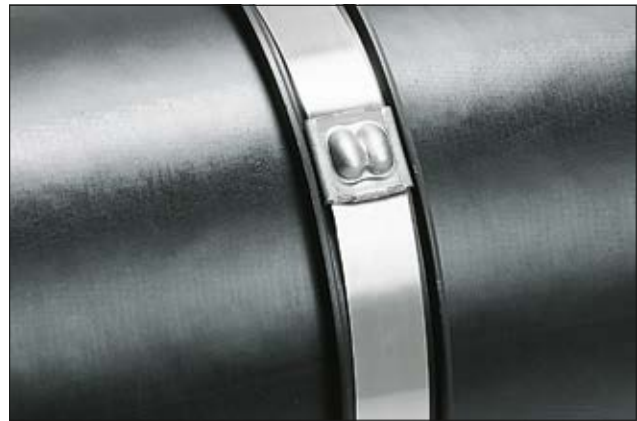
Protective channel LFPC, polyolefin, black.